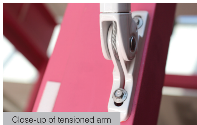
Close-up of tensioned arm