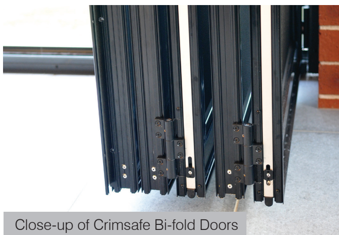
Close-up of Crimsafe Bi-fold Doors

Crimsafe Bi-Fold Security Doors come with a 10 Year standard Warranty, and an extended 10 Year limited warranty.