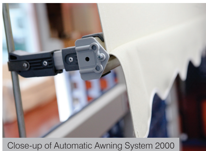
Close-up of Automatic Awning System 2000