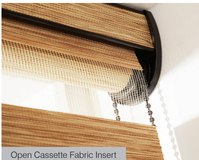
Open Cassette Fabric Insert