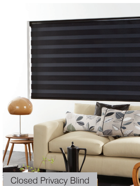
Closed Privacy Blind