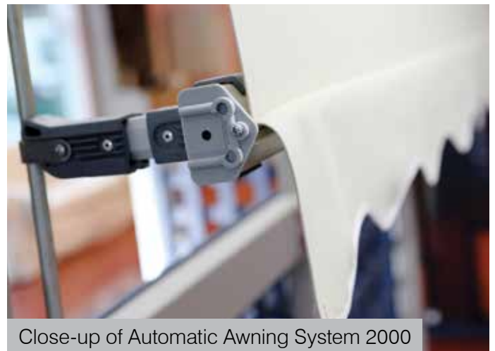
Close-up of Automatic Awning System 2000