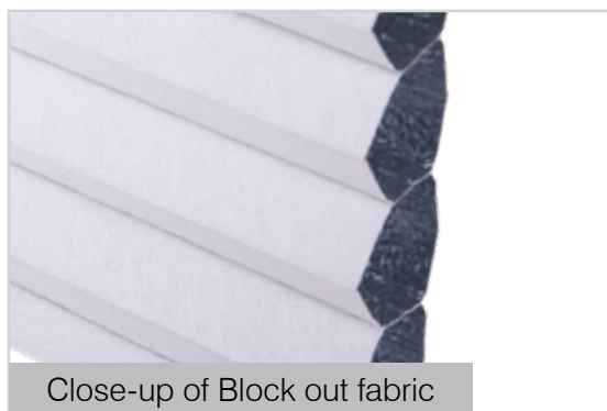
Close-up of Block out fabric