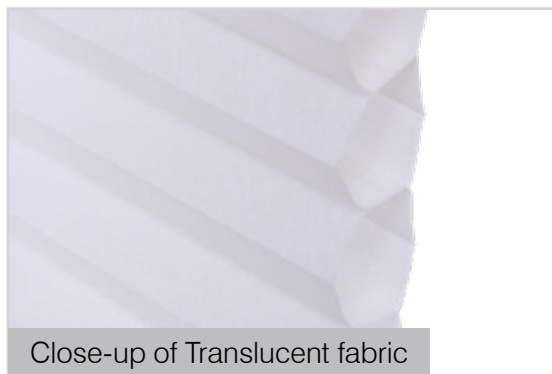
Close-up of Translucent fabric