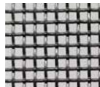
Stainless Steel Mesh