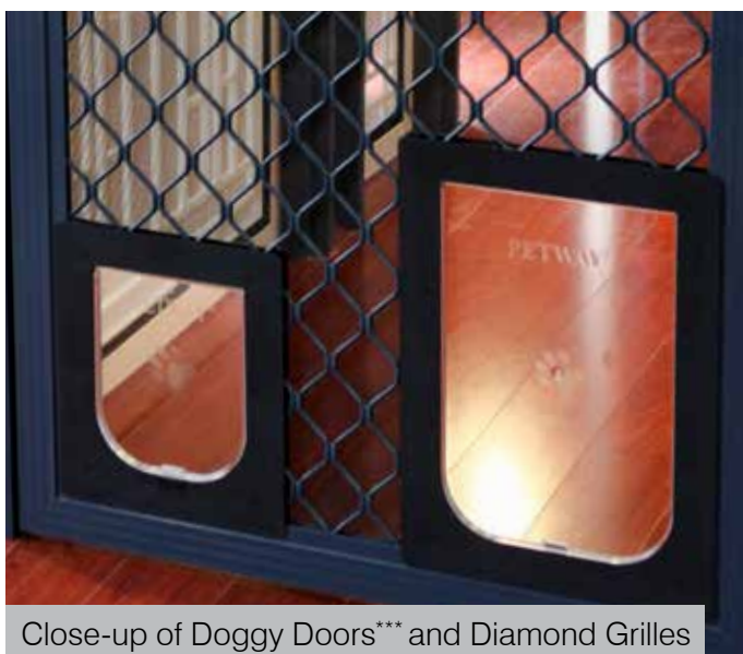
Close-up of Doggy Doors*** and Diamond Grilles

***Available in 3 sizes: small, medium and large.