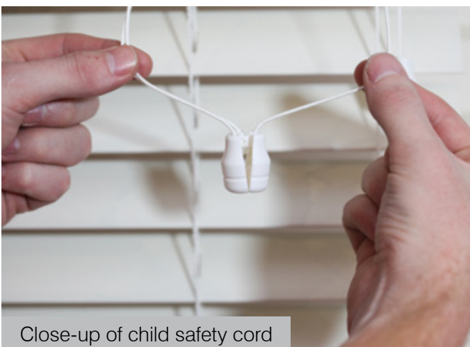
Close-up of child safety cord