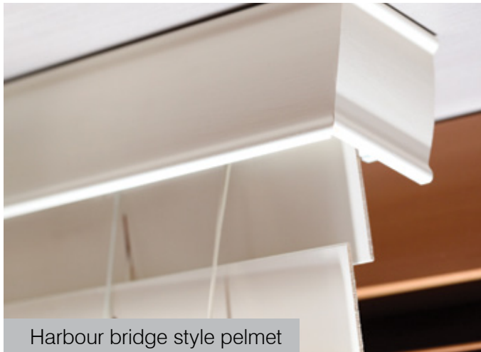
Harbour bridge style pelmet